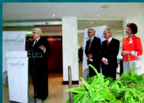
The laying of the Foundation Stone of Neapolis Smart EcoCity by H.E. Mr. Demetris Christofias the President of the Republic of Cyprus.